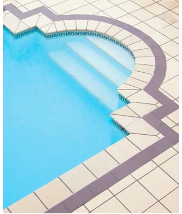
MAIN PICTURE & ABOVE: Terracotta tiles make an ideal surface around pools ■ BELOW: Achieve continuity by using the same tiles to lead towards other entertaining areas ■